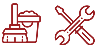
Deposits or fees pertaining to cleaning/damage