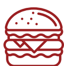
Food or drinks