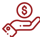
Any refundable deposits