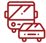
Transportation costs (airfare, gasoline, taxi, etc)